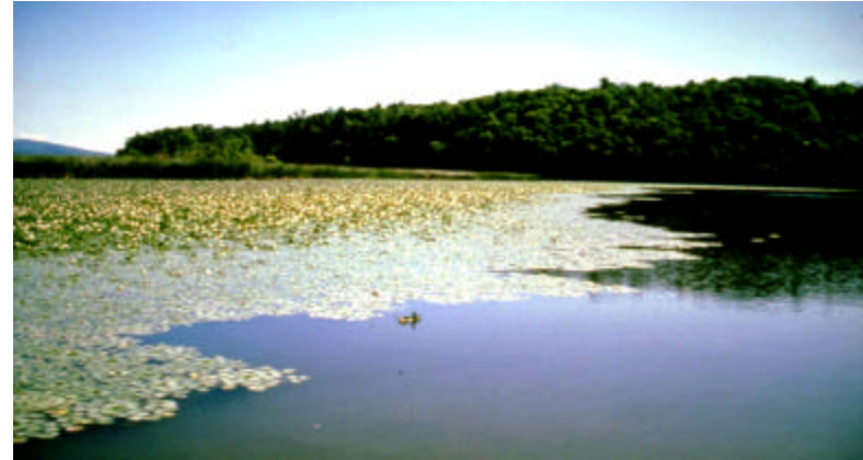
Water chestnut on Lake Champlain in Vermont

The department and its partners were on the verge of successful control, though not eradication, when funding was withdrawn for a second time in 1989. This lapse allowed the infestation to reoccur substantially, requiring an even greater effort when funding was rejuvenated. Now with the lake once again at a crucial point of "remission," department staff hopes that this time the commitment will remain stable.