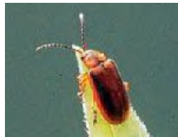
Loosestrife-eating beetle

The Advisory List of Invasive Aquatic Species , located in Appendix D, is the result of this analysis. Please note that while the label "species" is used in the table for purposes of simplicity, the list also includes organisms that are not considered species, e.g. viral pathogens.