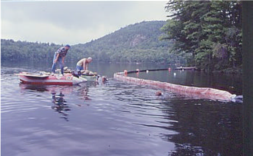
Variable milfoil hunt on Cushman Pond in Lovell, Maine.

Appendix B describes what state agencies, interagency groups, organizations and other partners are doing to implement the provisions of this important new law and carry out other state and federal initiatives to prevent, detect, and control the introduction and spread of invasive aquatic plants. A January 2002 report from DEP and DIFW to the Legislature titled, Invasive Aquatic Species Program Report provides a detailed account of these activities. 19 See also DEP and DIFW websites: http://www.state.me.us/dep/blwq/topic/invasive.htm and http://www.state.me.us/dep/blwq/topic/invasive.htm