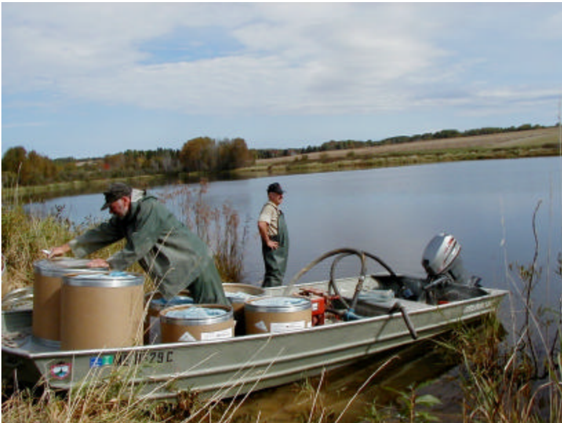
DIFW Biologists prepare to apply rotenone to eradicate illegally introduced smallmouth bass from Durepo Lake near Limestone.

Smallmouth bass were introduced into Umbagog Lake in 1985 and have spread throughout its tributaries, including the Rapid River where they may eventually out-compete and eliminate the renowned brook trout fishery. Because this invader has become so well established and cannot be eradicated in the Umbagog Lake system, Inland Fisheries and Wildlife regulations now encourage people to take as many as possible from the lake, as well as in