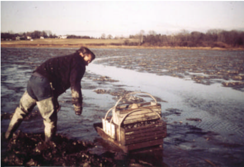
Diggers compete with the green crab for softshell clams.